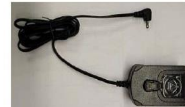
PWR-WUA5V4W0US Power Supply 5.2v, 1.1A